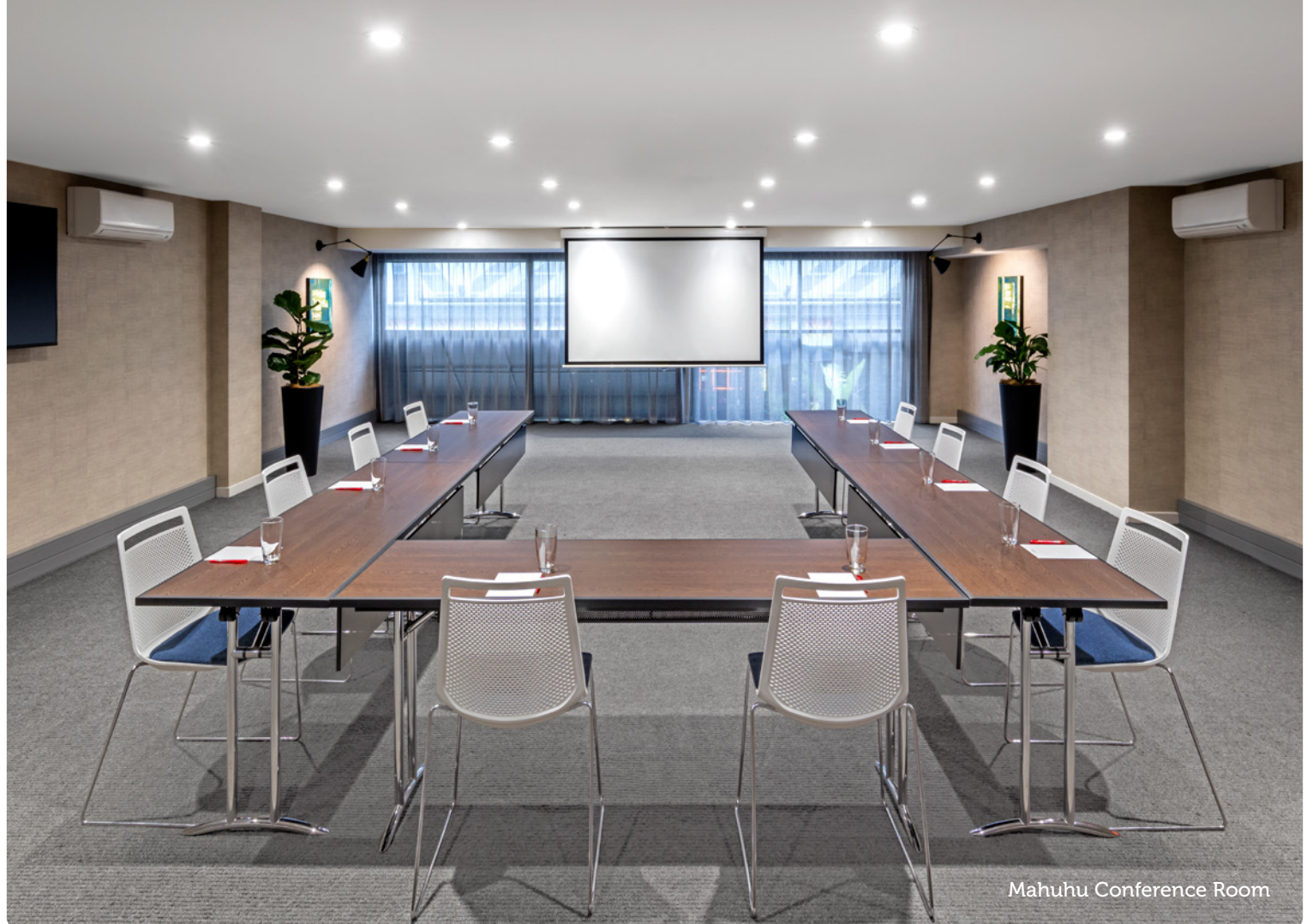
Mahuhu Conference Room