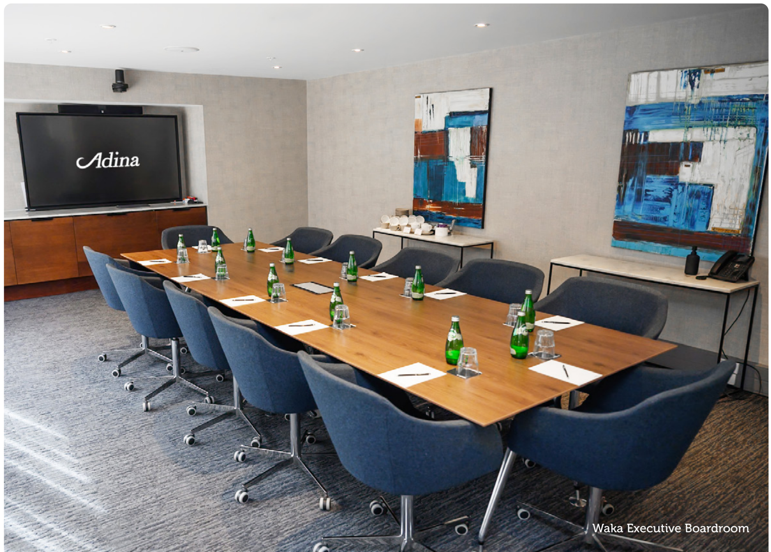
Waka Executive Boardroom